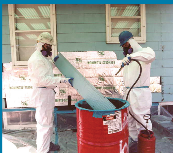
Cement Asbestos-Board Siding removal